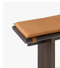
→ Cognac Leather