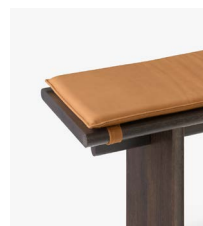
→ Cognac Leather