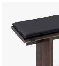
→ Elmosoft Leather 91102