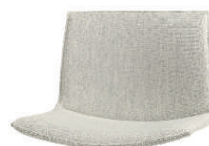
Removable cover Art. 3116