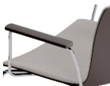
Armrests CV - pad (only for PO)