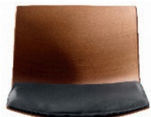
Cushion Art. 0230