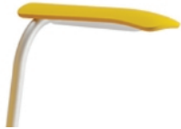
Armrests - polypropylene pad