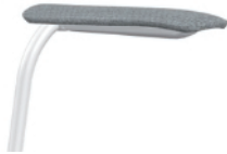
Armrests CI - only pad