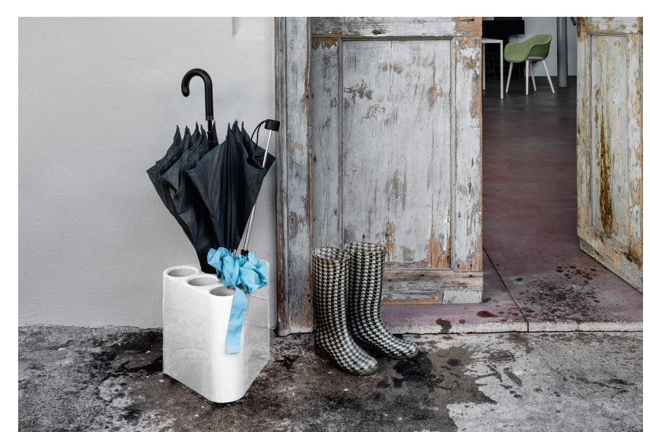
material / in glossy ABS.