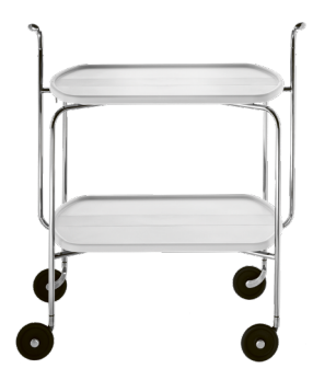
Frame in steel tube / Natural Shelf in polypropylene / White 1690 C