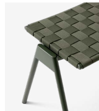
→ Bronze Green