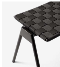
→ Warm Black