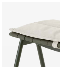
→ Heritage Papyrus