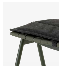
→ Heritage Char