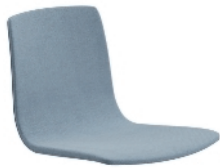
Removable cover Art. 7643