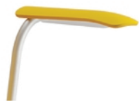
Armrests - polypropylene pad