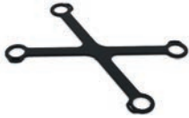
Connection kit (Pix Cubo) Art. 3021