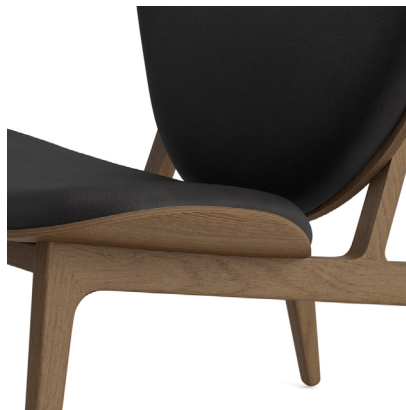
LIGHT SMOKED OAK DUNES ANTHRACITE 21003